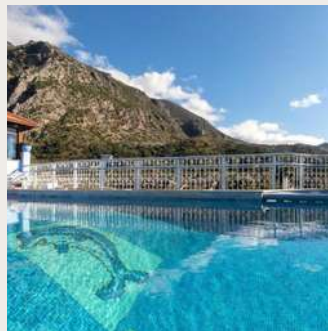
CHEFCHAOUEN HOTEL PARADOR