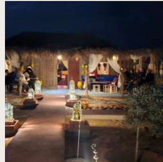
MERZOUGA SAHARA STARS CAMP