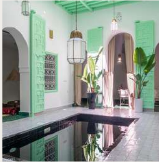
RABAT DAR RABIAA