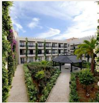
MARRAKECH ADAM PARK