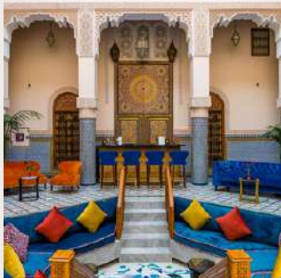
FES RIAD AL AMINE