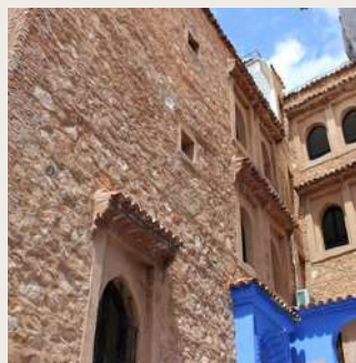
CHEFCHAOUEN RIAD LYNA