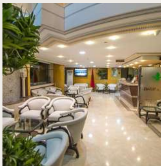
FES ZAH RAT AL JABAL HOTEL