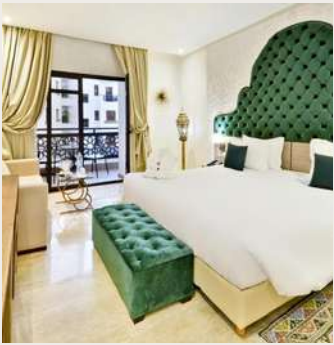
FES HERITAGE LUXURY BOUTIQUE HOTEL