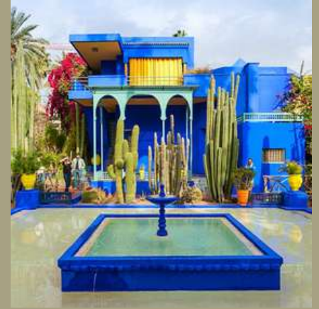
YVES SAINT LAURENT GARDEN