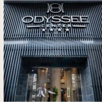
CASABLANCA ODYSSEE HOTEL