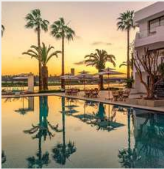
RABAT DAWLIZ ART AND SPA