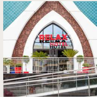
CASABLANCA RELAX HOTEL