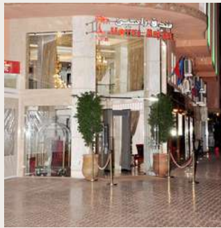
MARRAKECH HOTEL RACINE