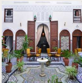
FES RIAD ALASSALA