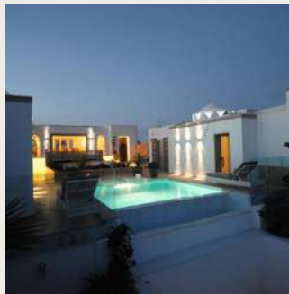
RABAT EUPHO RIAD