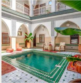
MARRAKECH RIAD CORNES DES GAZELLE