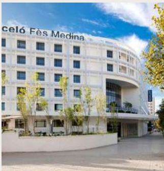
FES BARCELO HOTEL