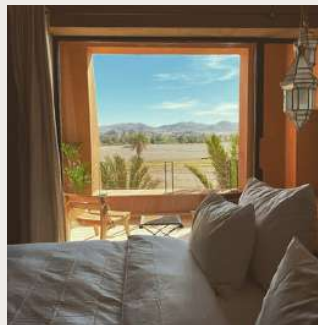
OUARZAZATE KASBAH TAMESNA