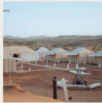
MERZOUGA ORIGINAL CAMP