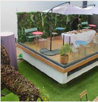
RABAT NJ HOTEL