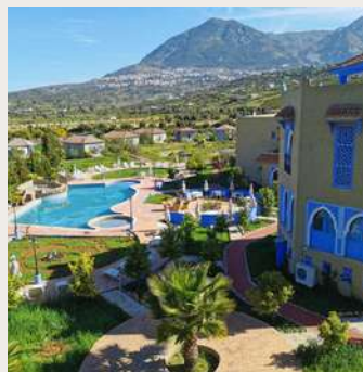
CHEFCHAOUEN DAR BA SIDI HOTEL