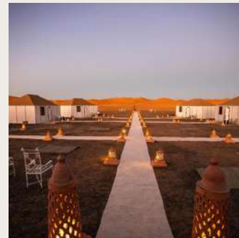
MERZOUGA AIOUR LUXURY CAMP