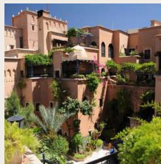
OUARZAZATE DAR DAIF HOTEL