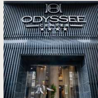
CASABLANCA ODYSSEE HOTEL