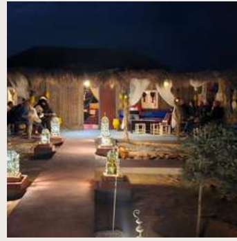
MERZOUGA SAHARA STARS CAMP