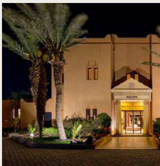
OUARZAZATE OSCAR STUDIO HOTEL