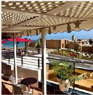
RABAT HOTEL DES OUDAIAS