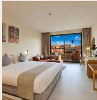
MARRAKECH ARI BOUTIQUE HOTEL