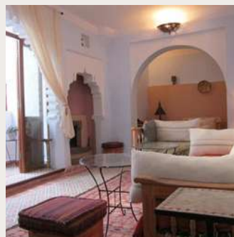
CHEFCHAOUEN HOTEL RAS EL MA