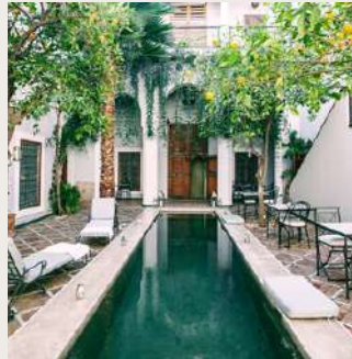
MARRAKECH LE RIHANI