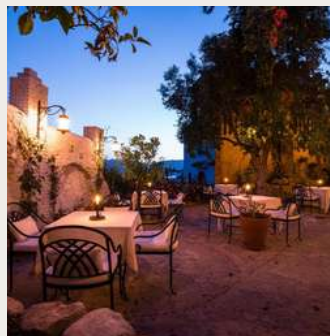
CHEFCHAOUEN DAR ECHCHAOUEN