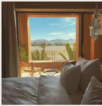
OUARZAZATE KASBAH TAMESNA