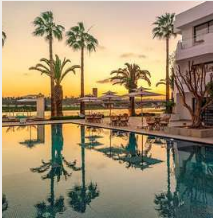
RABAT DAWLIZ ART AND SPA