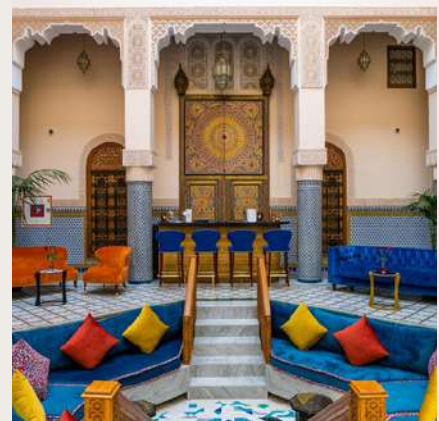
FES RIAD AL AMINE