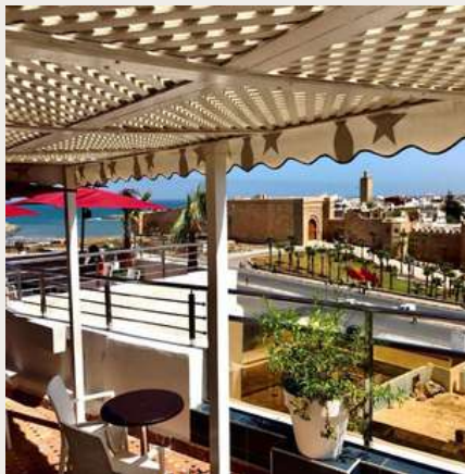
RABAT HOTEL DES OUDAYA