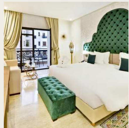
FES HERITAGE LUXURY BOUTIQUE HOTEL