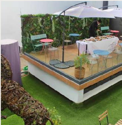
RABAT NJ HOTEL