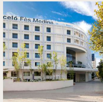
FES BARCELO HOTEL