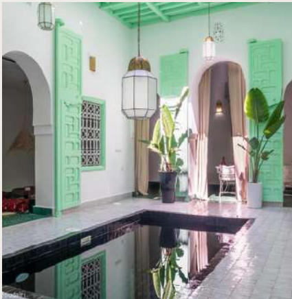
RABAT DAR RABIAA