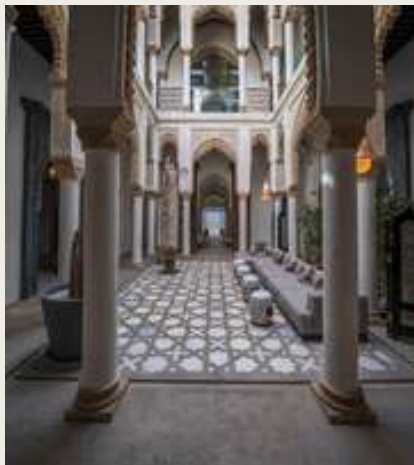
RABAT RIAD EUPHORIAD